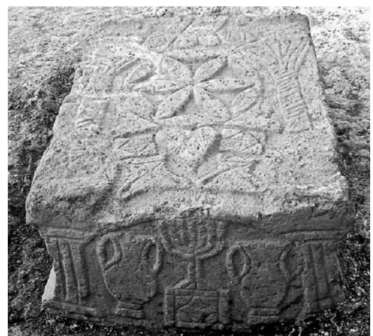
Magdala Synagogue iv 2500 coins, many dating from the time of Jesus and pottery corroborate this as an A++ archaeological proofs