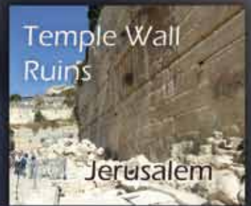
Temple Wall Ruins